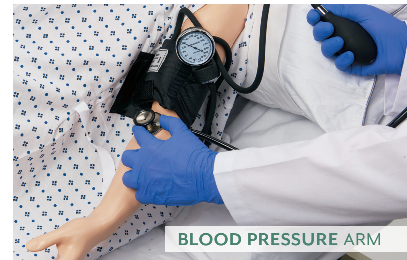
BLOOD PRESSURE ARM